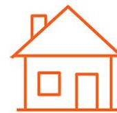
Safe, Stable Housing