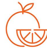
Healthy Nutritious Food